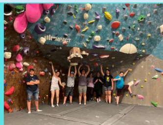
Teen Talk Climbing Event

And there is more...HRN will be starting back up with regularly scheduled monthly offerings! We adore autumn and can't wait to get back into the swing of things. We hope to see you soon!