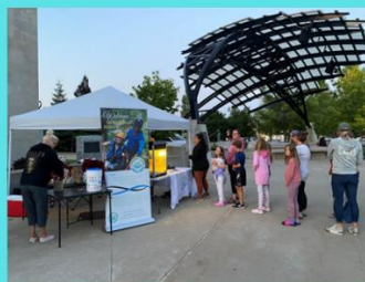
Goderich Movie Night in the Square